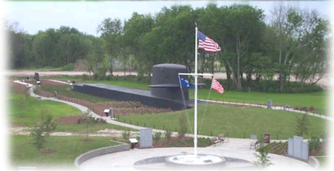
Sail of the USS Lewis and Clark at Rest