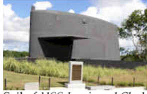
Sail of USS Lewis and Clark